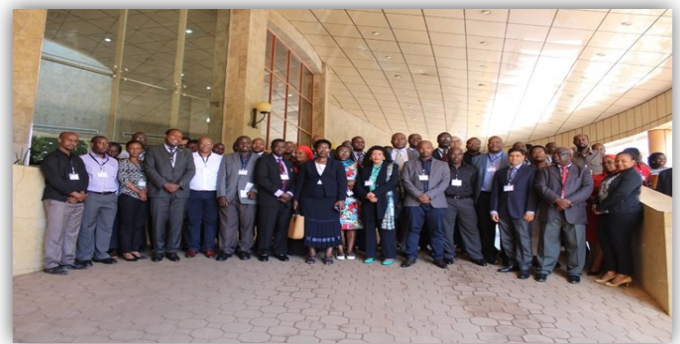
PS MOH Uganda poses for a group photo with members of the Regional Steering Committee (RSC) after officially opening the 3 rd RSC meeting in Kampala, Uganda

During the meeting five countries. (Botswana, Malawi, Mozambique, Rwanda, Tanzania) were identified and earmarked for mentorship towards attainment of candidate SRL status by the end of the project. In July this year, ECSA-HC as the Principal recipient to the Global Fund project commissioned a Mid-Term Review to evaluate the project's progress. During this meeting the committee members also had an opportunity to validate findings and make recommendations as way forward in implementation of project activities.