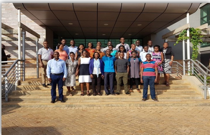
Group Photo of SRL staff taken during the Laboratory Quality Management Systems and Internal Audit course

As part of strengthening the capacity of its mentors the SRL Uganda organized a 5-day training in basic laboratory Quality Management Systems and internal audit based on ISO 15189 at SRL Uganda between the 2 nd and 7 th of October 2017.