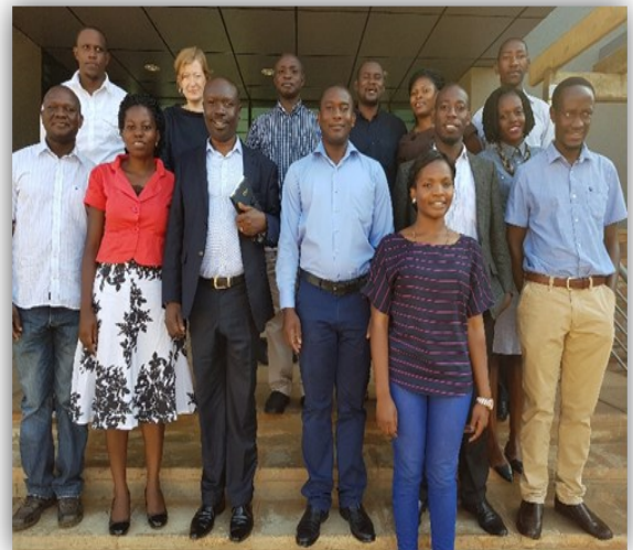
SRL Uganda team with KNCV consultants following the curriculum development workshop

The curriculum development workshop was attended by a team of 12 SRL staff (4 females and 8 males) who are currently involved in the development and implementation of various training courses.