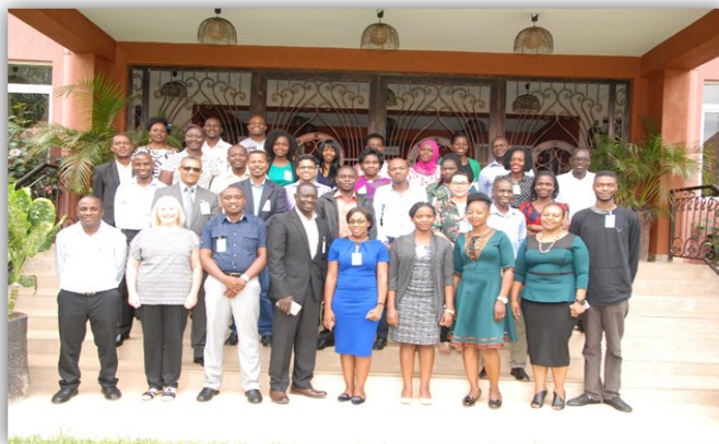
Country Representatives pose for a group photo during the QSM training workshop, Entebbe Uganda

Twenty-two (22) participants from 18 countries (Burundi, Rwanda, Kenya, Lesotho, Malawi, Mauritius, Mozambique, Namibia, Seychelles, Eritrea, Somalia, South Sudan, Swaziland, Tanzania, Zambia and Zimbabwe, Botswana and Uganda) attended the course and displayed immense enthusiasm and keen interest during each session of the 5-day training workshop.