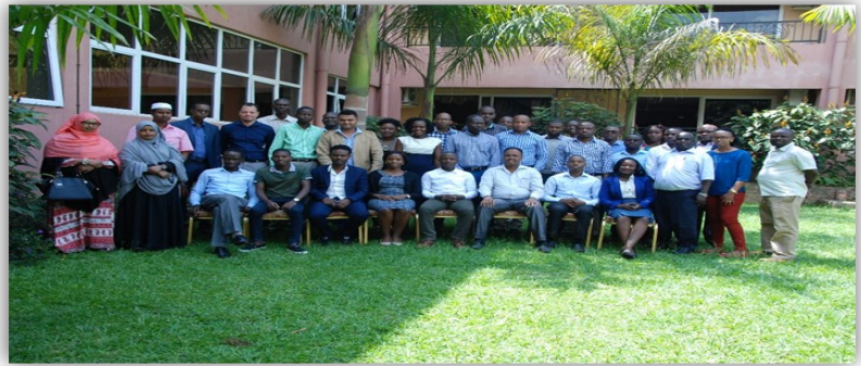
Participants group photo during the Regional Biosafety and Biosecurity training in Entebbe, Uganda

The training was facilitated by regional experts and national bio risk trainers drawn from different institutions within Uganda including the TB Supra Reference Laboratory, Uganda Virus Research Institute and University Research Co. LLC, and was delivered through didactic sessions, demonstrations, exercises, interactive discussions, and practical, Case Scenarios, Assignments, Role Play and Video Presentations. A total of 29 participants from the 17 project coun-