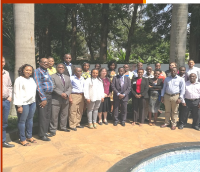
A group photo of the ECSA-Health Community and the Uganda SRL joint Technical Support Workshop facilitated by the GMS from 26-28 July, 2016 in Moshi, Tanzania.

Regional Grants are critical in addressing common regional health problems. However, they are complex and are associated with a lot of challenges especially in governance and communication across the regional grant structures leading to many regional grants not achieving their desired objectives.